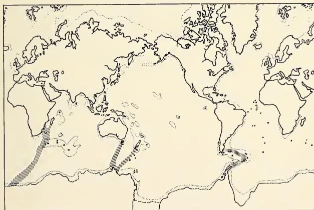
Fig. 1. Present location of undersea ridges that might, at a time of isostatic adjustment, have been emergent ridges or at least island chains that frogs would have been able to cross.

Antarctica is at present connected with each of the three southern continents, South America, Africa, and Australia, by the following undersea ridges at depths appreciably less than 1000 m: the Scotia Ridge to South America; the Macquarie Rise to Australia; and the Atlantic-Indian Rise, the West Indian Ridge, and the South Madagascar Ridge to Africa. Of these, the Scotia Ridge appears at the surface as the Falkland Islands, South Georgia Island, the South Sandwich Islands, and the South Orkney Islands. The Macquarie Rise reaches the surface as MacQuarie Island and, on the prong that extends to New Zealand, as the Auckland Islands. The Ridge to Madagascar and South Africa appears at the surface as the Bouvet and Prince Edward Islands. These ridges are shown in Figure 1.